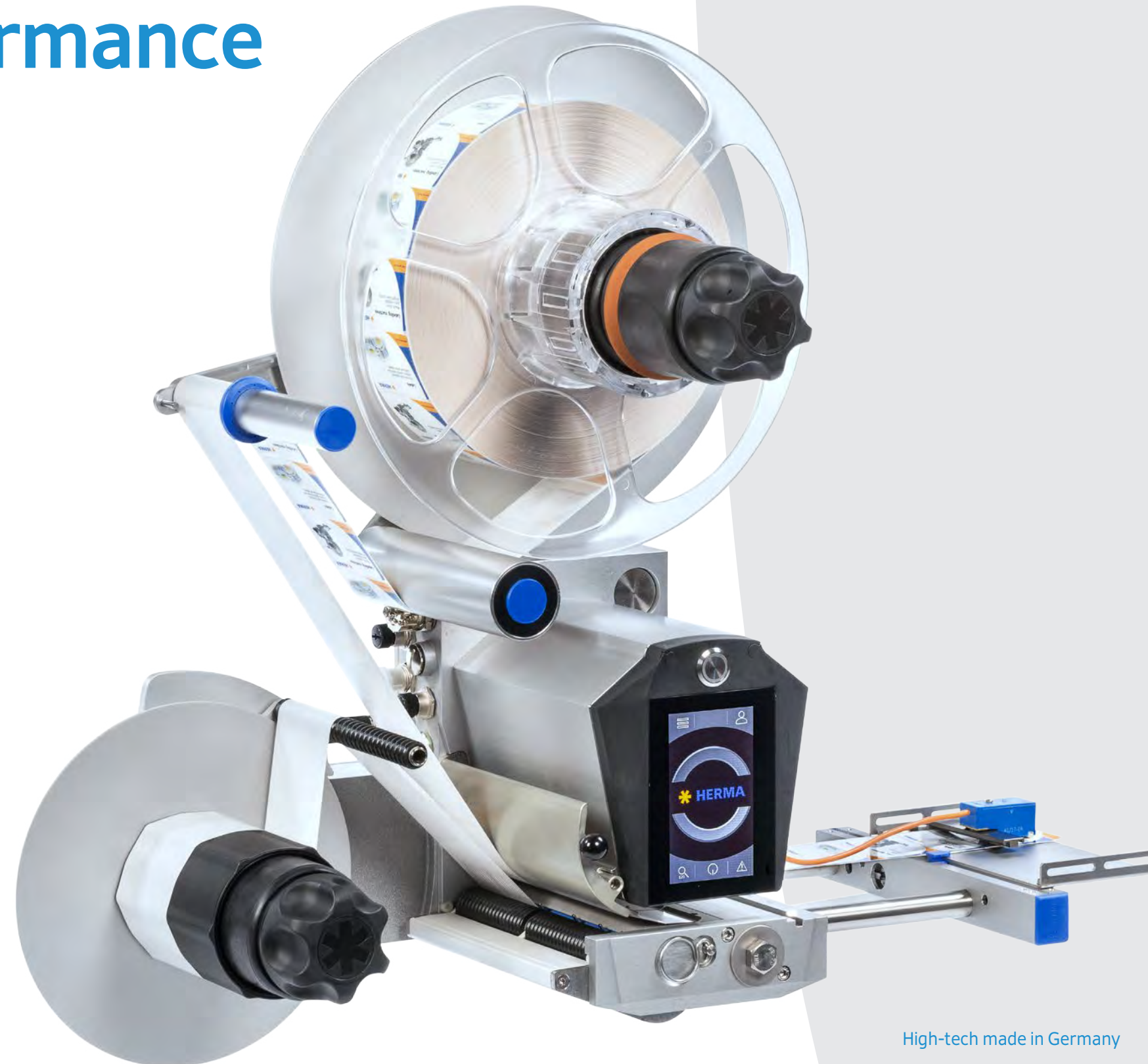
High-tech made in Germany

Quick set-up: Short make-ready time thanks to innovative technologies such as assisted backing paper feed & automatic label length detection.