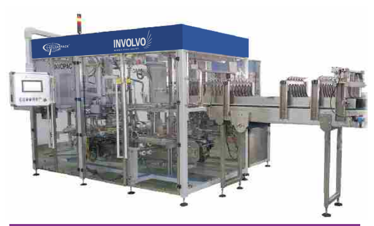
Wrap Around Case Packer