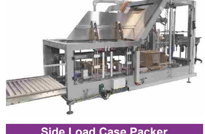
Side Load Case Packer