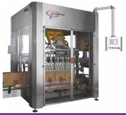
Robotic Case Packer