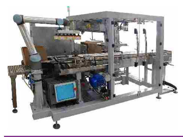
Cobot Monoblock Case Packer