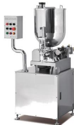
3. Liquid filler (Servo or air-cylinder)

- In case of zipper bags, zipper opening and closing device are needed.