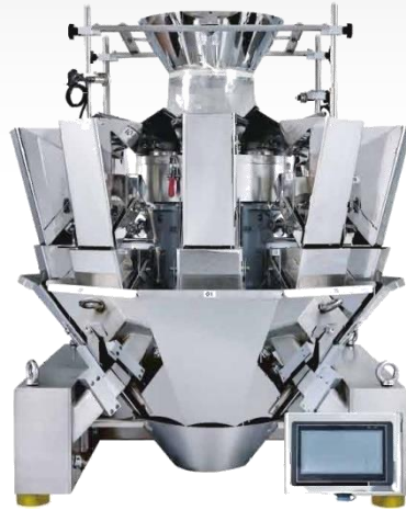
2. Multi-head weigher