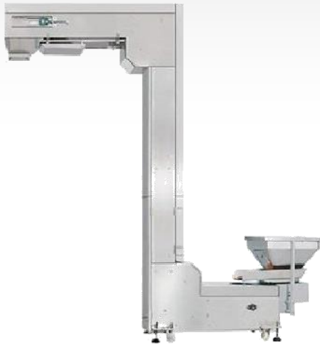
1. Z-type conveyor